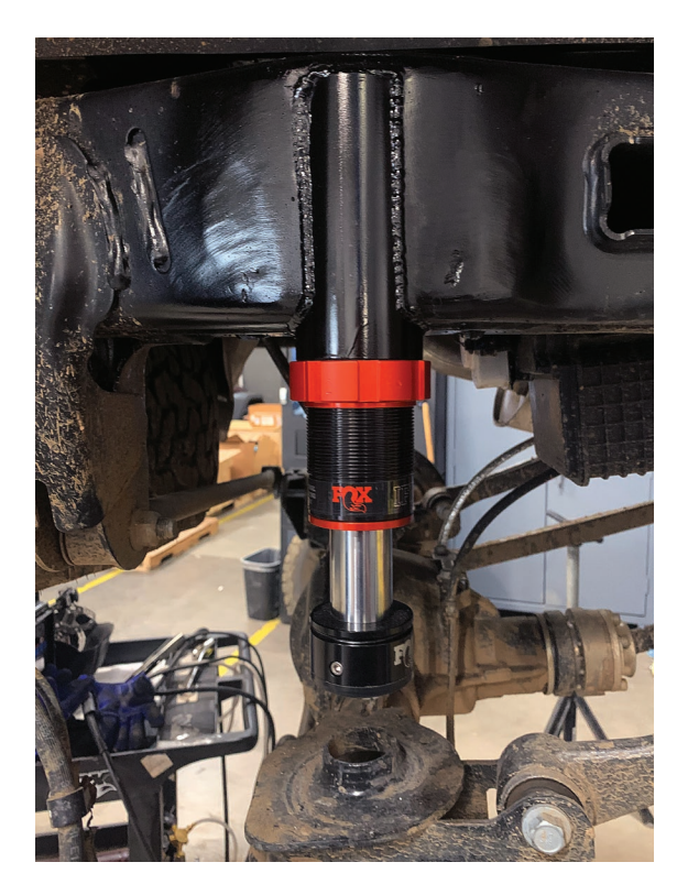
Figure 13: Passenger side shown