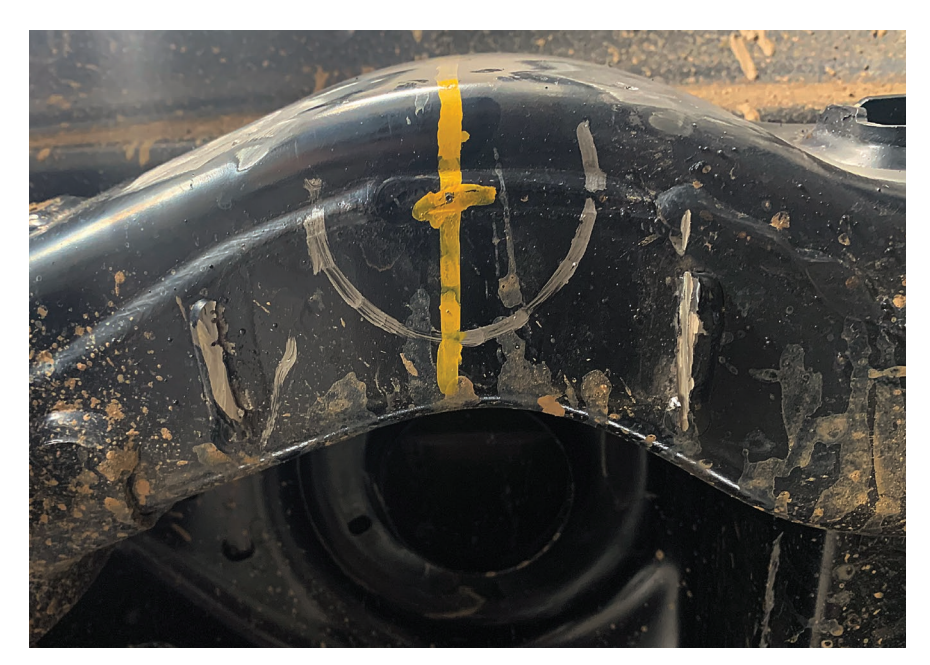
Figure 4: Passenger side shown

9. Using the line you made earlier, continue that line across the bottom of the frame rail. Make sure the line is between the 2 welds on the bottom of the frame (Figure 4).