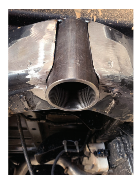
Figure 10: Passenger side shown

17. Once tack welded, fully weld the FOX bump stop holder into the frame (Figure 11).