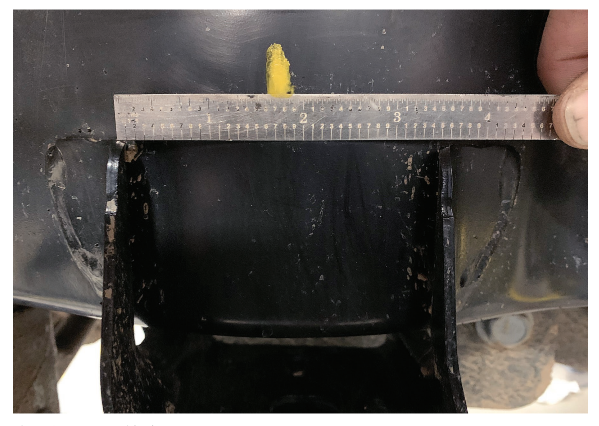
Figure 1: Passenger side shown