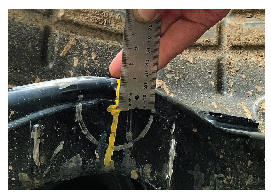
Figure 5: Passenger side shown

10. Once you draw your line, use a center punch to make an indent 1" away from the outside edge of the frame rail on your line. The indent should be some where on the OEM weld seam on the bottom of the frame rail (Figure 5).