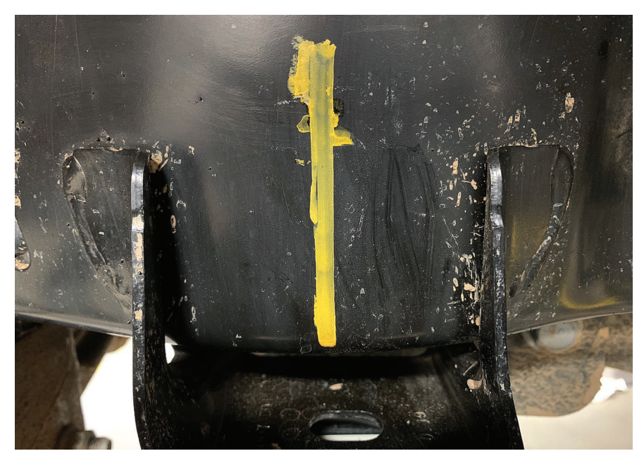
Figure 2: Passenger side shown

7. Using the mark you just made, draw a line that goes from the mark you just made to the bottom of the frame rail. This is going to be the centerline of where to mount the bump stop (Figure 2).