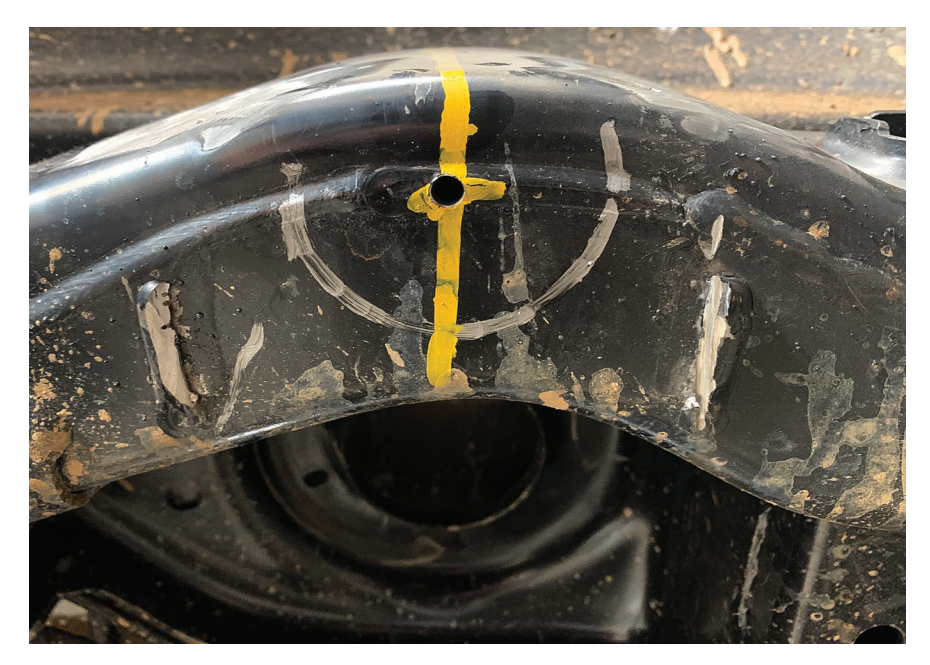
Figure 6: Passenger side shown

11. Once the punch mark is made, use an 1/8" drill bit to drill a pilot hole in the frame (Figure 6).