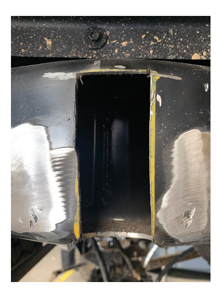
Figure 9: Passenger side shown

14.. Once you have your rectangle drawn, using a cut off wheel or reciprocating saw, cut out the rectangle from the frame rail (Figure 9).