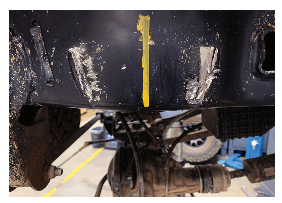
Figure 3: Passenger side shown

8. At this point, You will need to remove the OEM bump stop mount and holder from the frame. To do so, using a cutoff wheel or reciprocating saw cut/ grind off the welds that attach the OEM bump stop holder to the frame. DO NOT CUT INTO THE FRAME. DO NOT GRIND THE AREA SMOOTH YET OR REMOVE THE LINE YOU JUST MADE IN THE PREVIOUS STEP! You will be using these for reference (Figure 3).