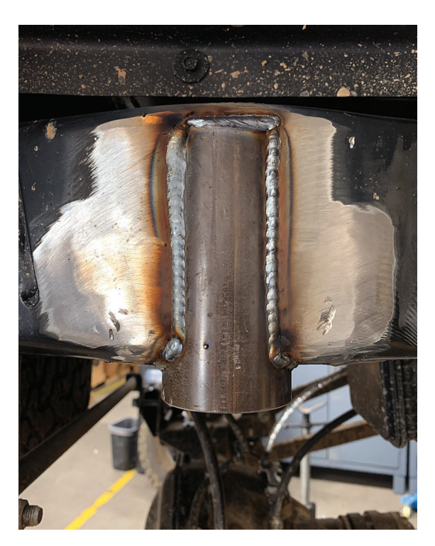
Figure 11: Passenger side shown

17. Once tack welded, fully weld the FOX bump stop holder into the frame (Figure 11).